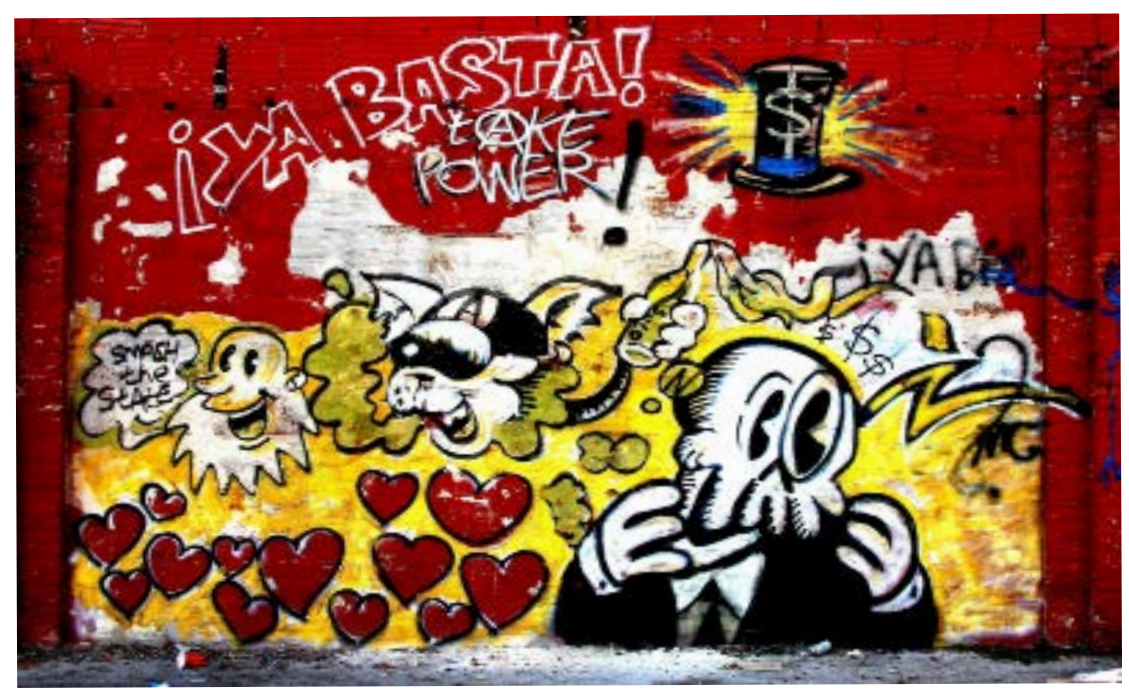
YA BASTA! Public mural. © 2012 Paul Garner