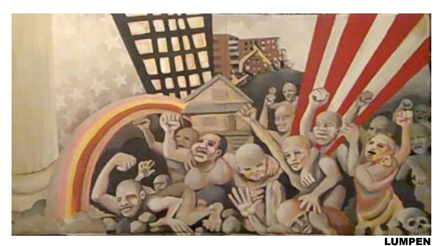
Latex house paint on wood. Part of the "Public Housing" collaborative art show at the University of Memphis.