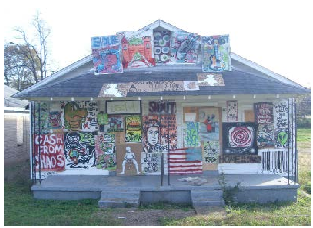
IT COULD HAPPEN TO YOU Abandoned home in Memphis (now demolished).