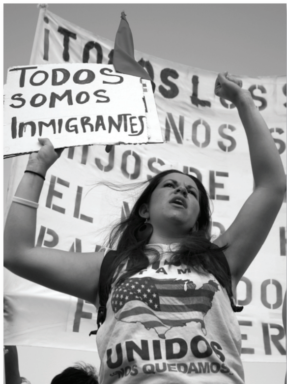
A young woman protests at a May Day rally in San Francisco.