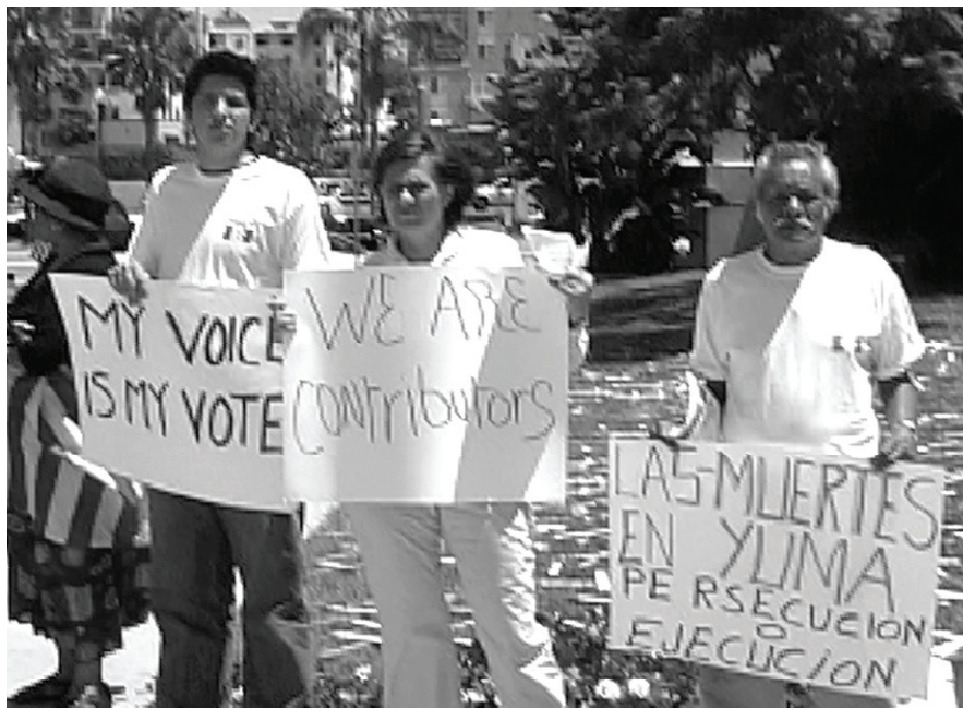
San Diego, CA--Protesters at a congressional judiciary hearing on immigration stand in front of a lawn strewn with crosses, each representing one of the thousands of Mexican immigrants who have died trying to cross the border.

These are issues that we hope SP-USA candidates will speak up about. The Civil Rights Section of our platform calls for an end to the militarization of the border and an end to police raids where immigrants congregate. We defend the rights of all immigrants to health care, education, and full legal rights. ●