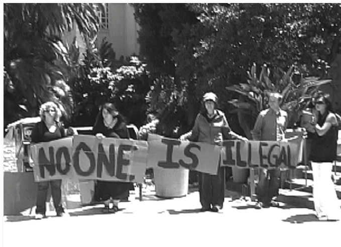
In San Diego, CA, the Friends of Day Laborers stage a protest outside the County Administration Building during a federal congressional hearing on immigration.