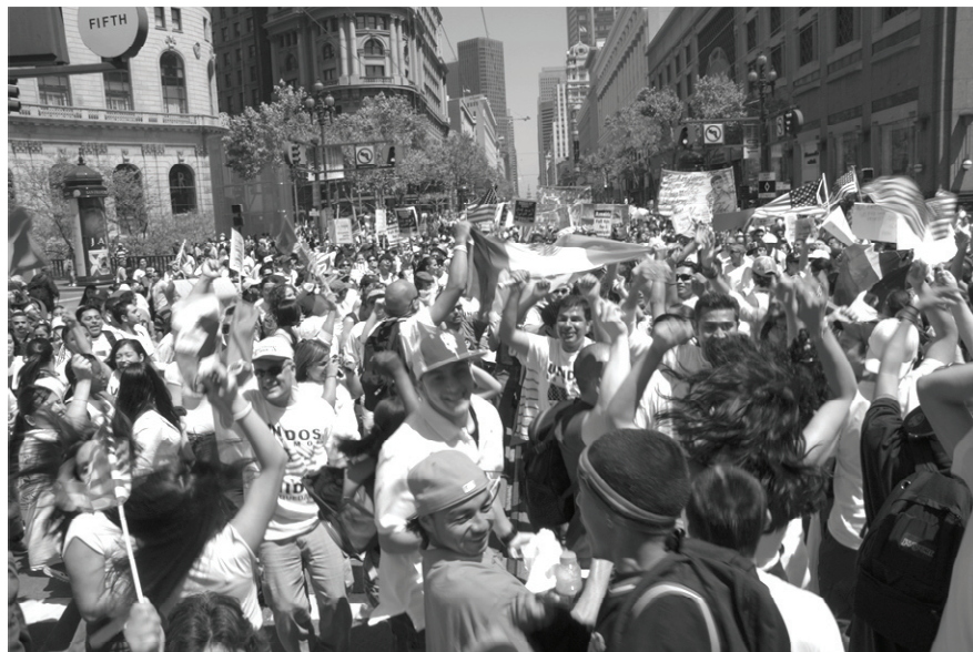
Un Dia Sin Migrantes, San Fransisco.

Since the Chicano movement, the United States has had a new influx of immigrants that includes both Mexicanos and other Hispanics. The leadership of the Chicano movement and many older Mexicanos and Hispanics are watching the immigration debate with interest as they try to protect their perceived power within the