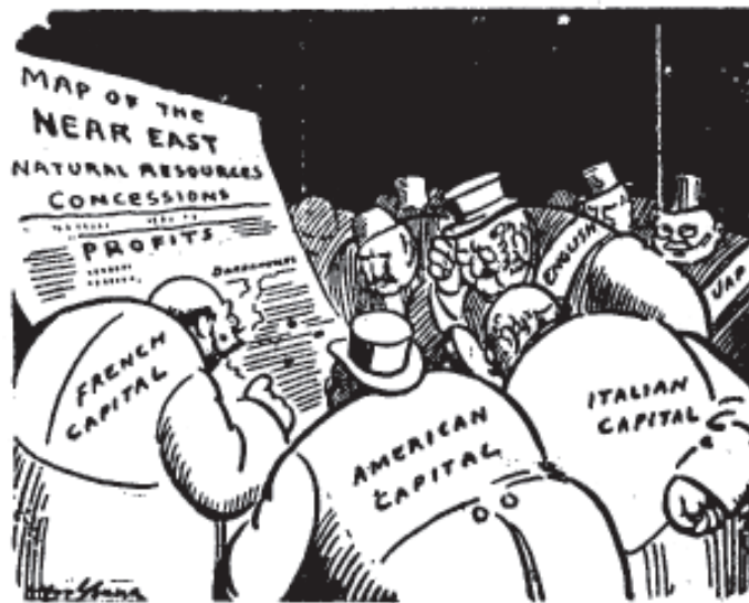
The big bosses privately planning another fight